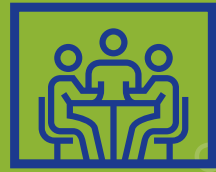
Confined and enclosed spaces